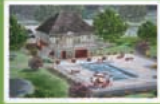
A rendering of the Clubhouse and Pool